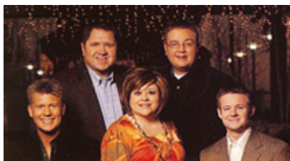
◀ The PERRYS